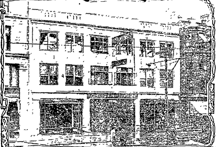
FRONT OF TAYLOR-PALMER GARAGE AFTER THE FIRE

The cause of the fire which destroyed the garage of the Taylor-Palmer garage company at 171 Huntington av early Continued on the Second Page.