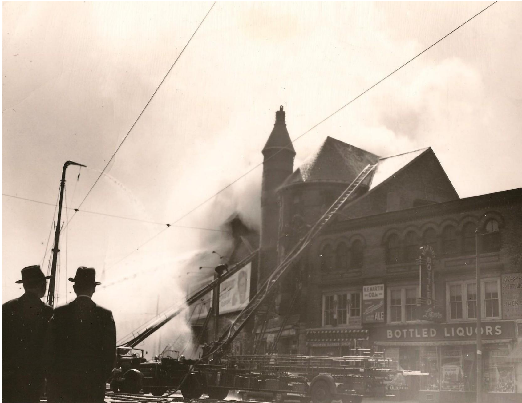
Roxbury Crossing Railroad Station Fire, May 14, 1950. Fire in the 1888, 4-story brick, New Haven RR building, with Café on first floor, 2 Alarms, Box 2245, 1530 Hours. Fire photos, courtesy Bruce Cook