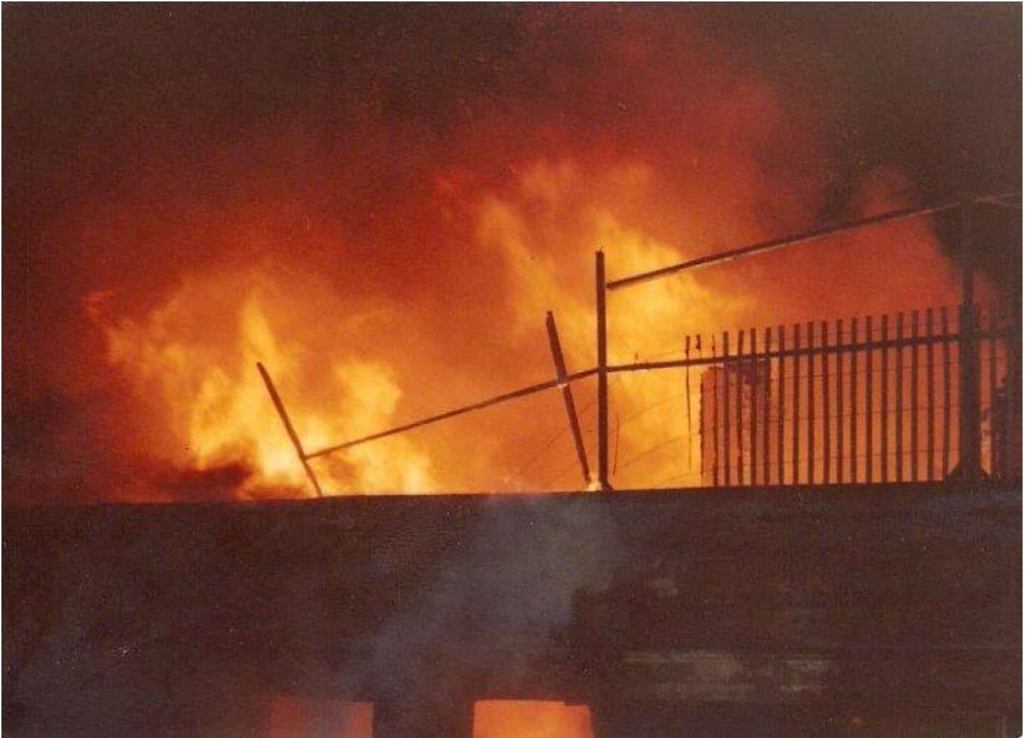
Heavy fire through the roof.

Photos courtesy of Fred DellaPorta, who lived in the 179-181 Salem Street building.