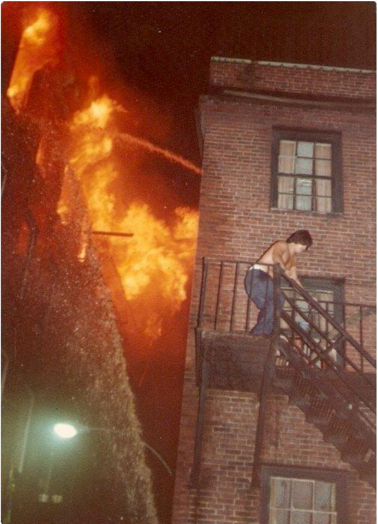
Heavy fire conditions on 4 th and 5 th floors. Evacuations in progress, 2 lines operating.