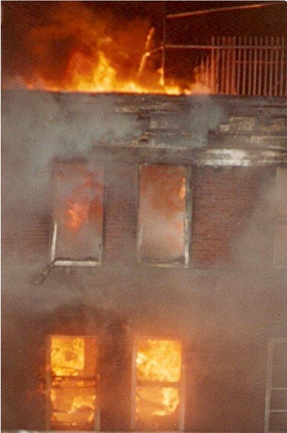
Fire on 4 th and 5 th floors, and through the roof.