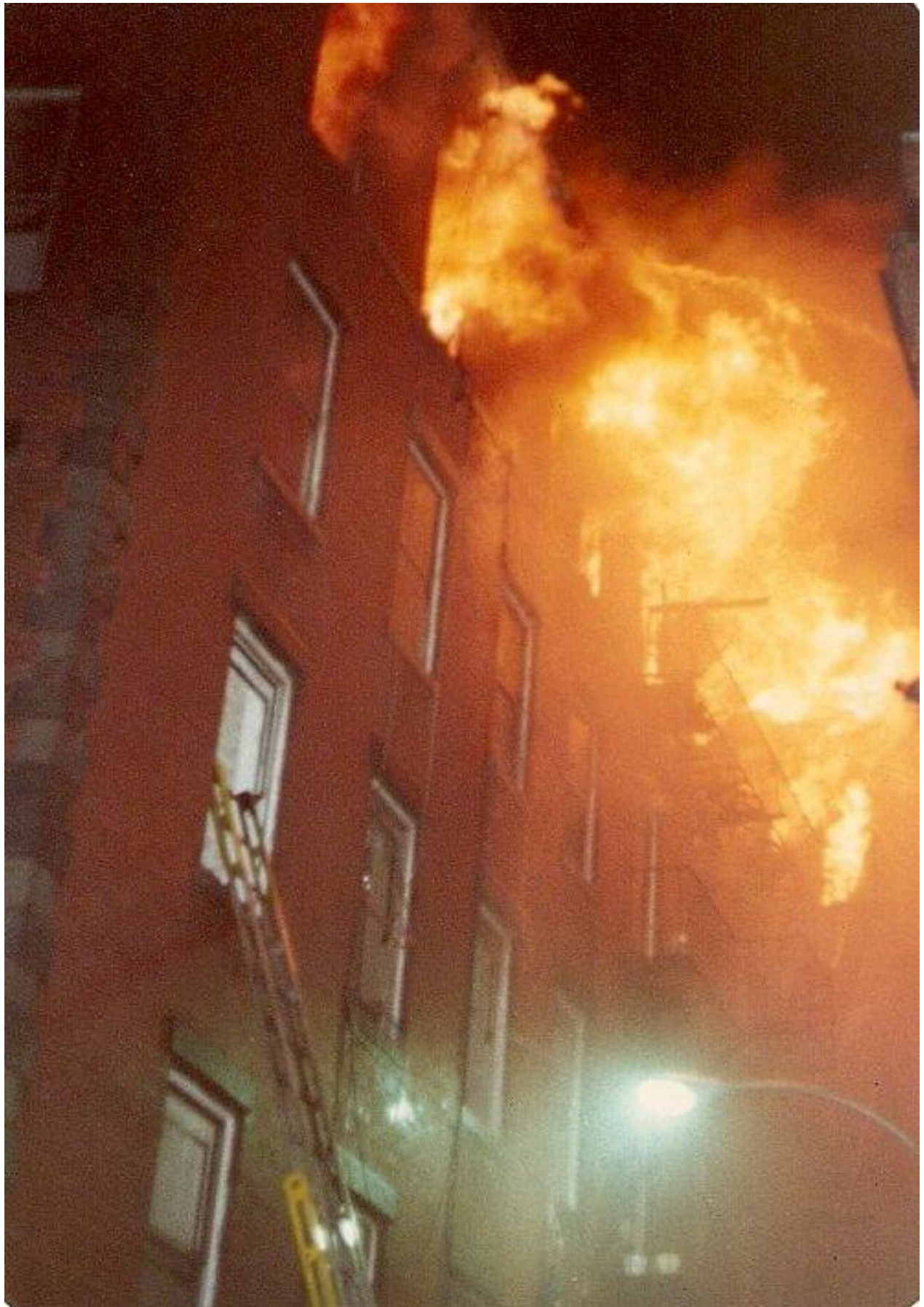
Heavy fire conditions on the 5 th floor. A ground ladder in the foreground.