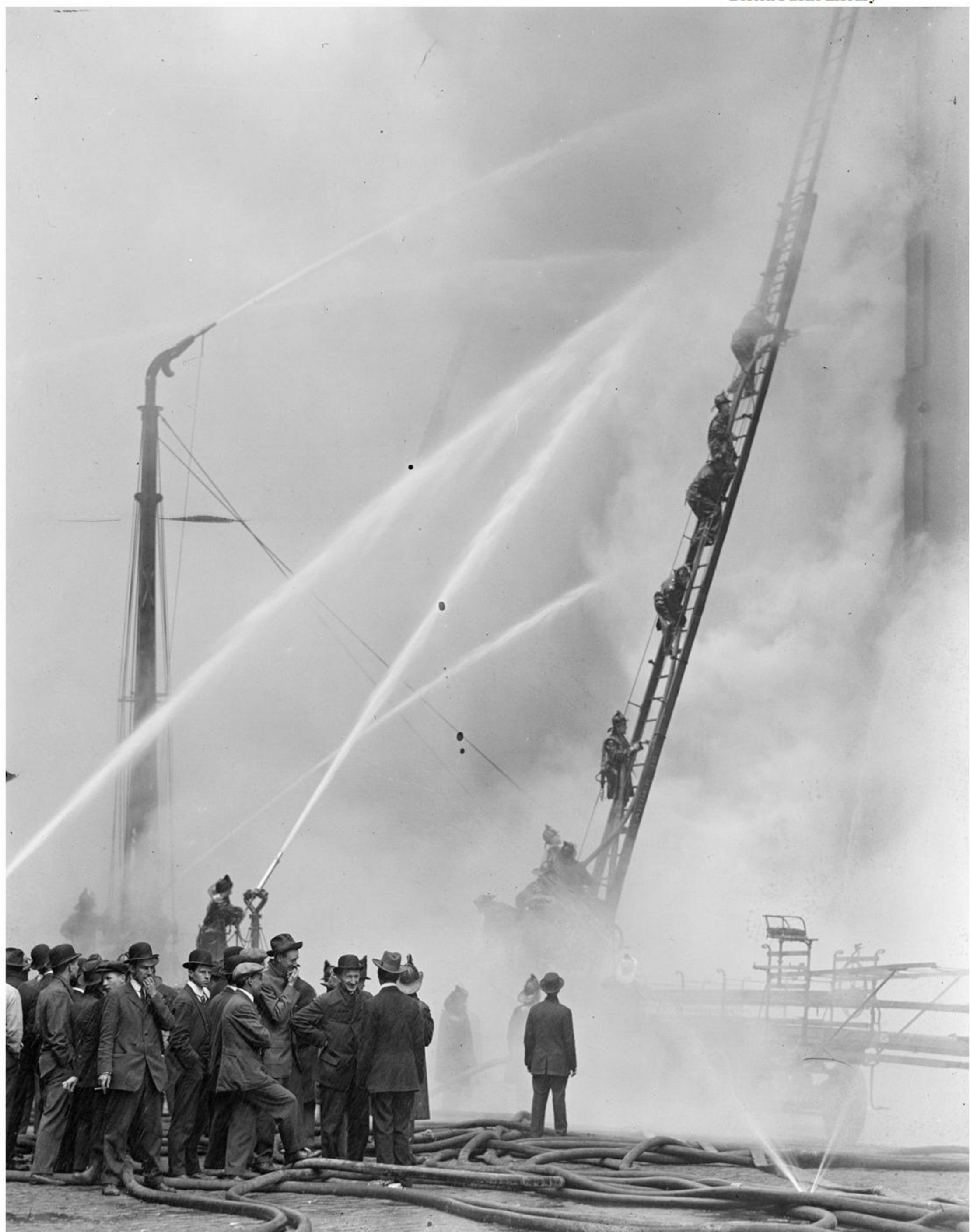
Boston Public Library