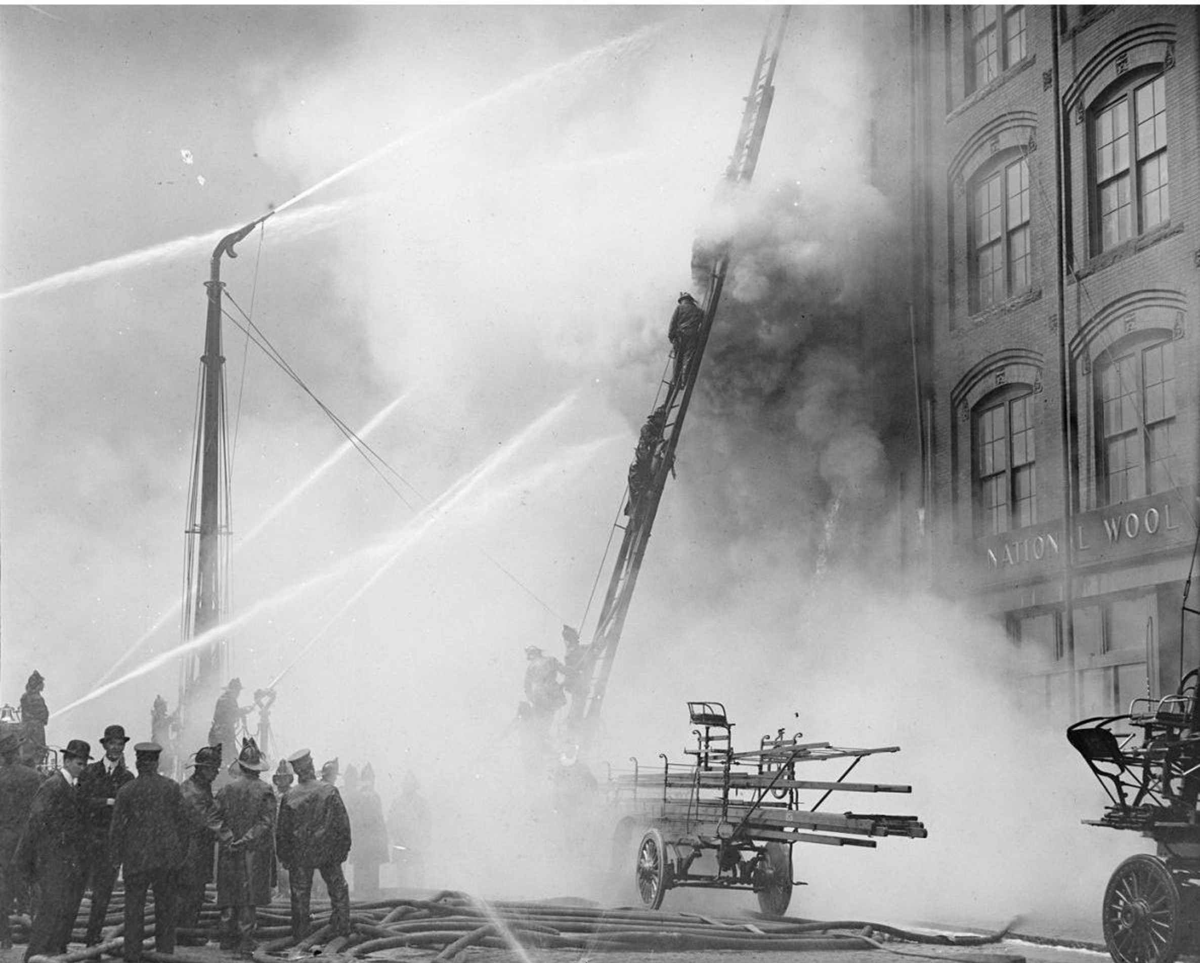
Boston Public Library