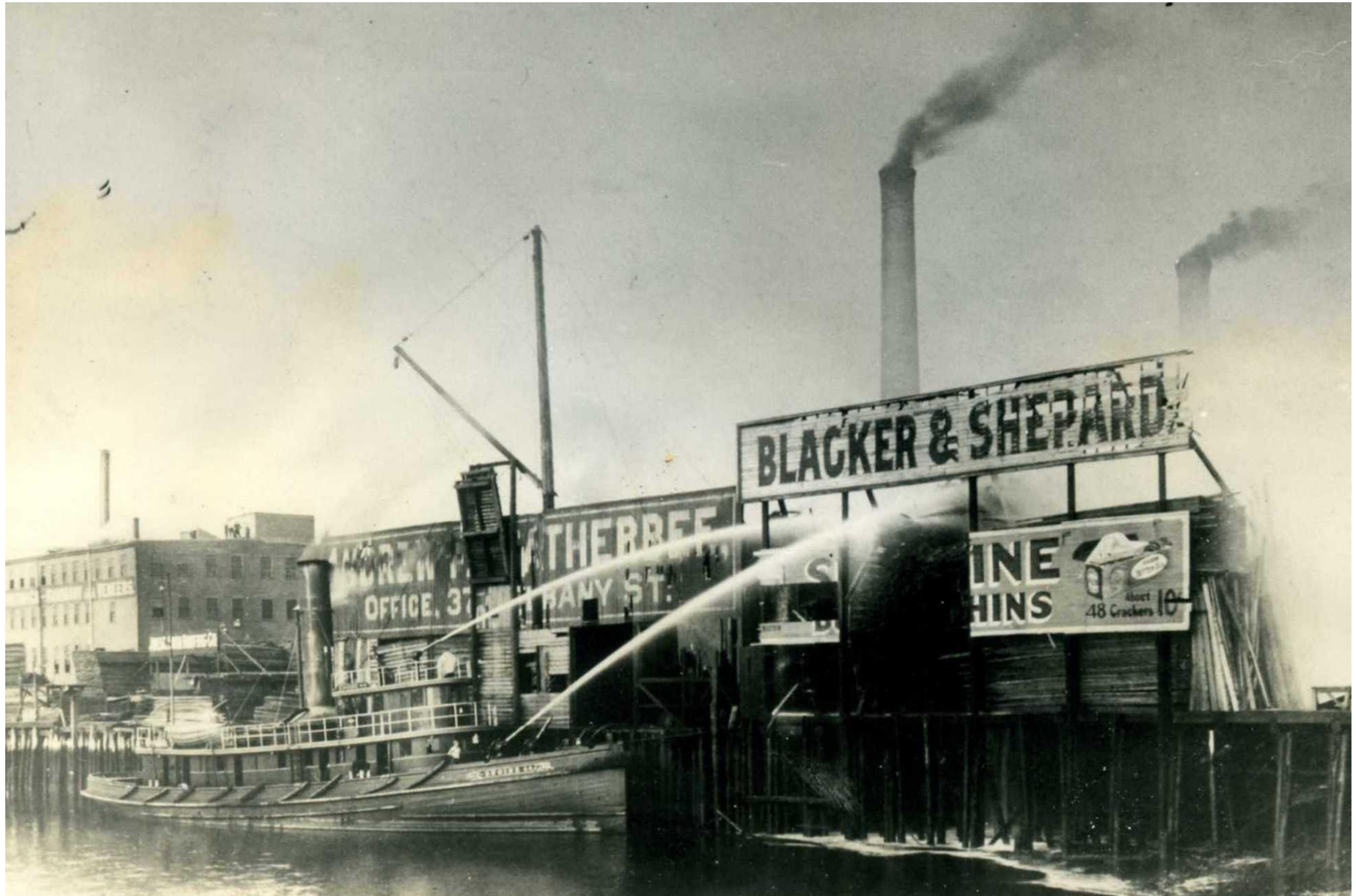
Blacker & Shepard Lumber Yard Fire, August 9, 1910 350 Albany Street, South End, including buildings on Albany, Dover, Bristol & Thayer Streets 6 Alarms, Box 58, 1817 Hours.