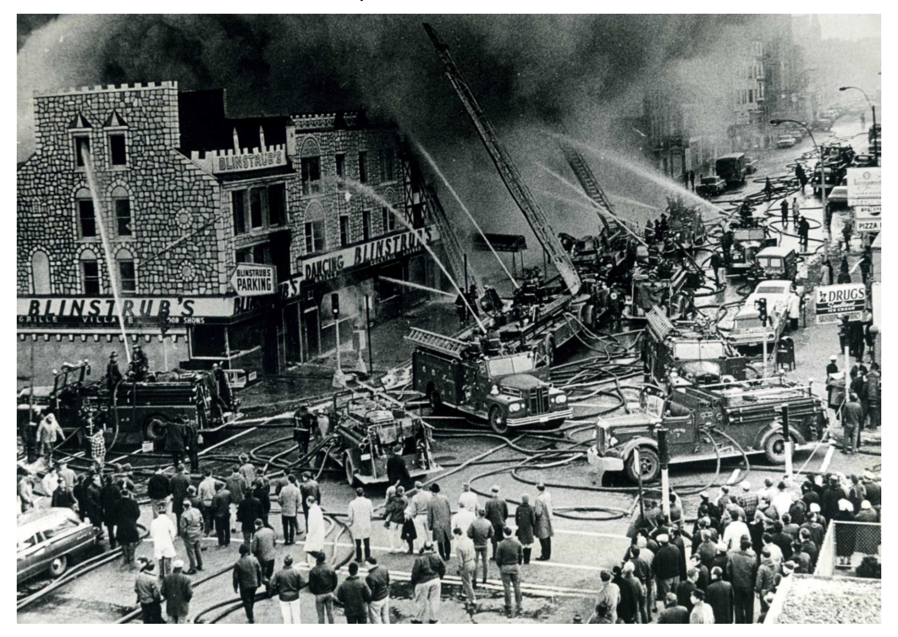
Blinstrub's Village Fire, February 7, 1968, 0844 Hours. 300-310 West Broadway, at D Street, South Boston, Box 7222, 5 Alarms.