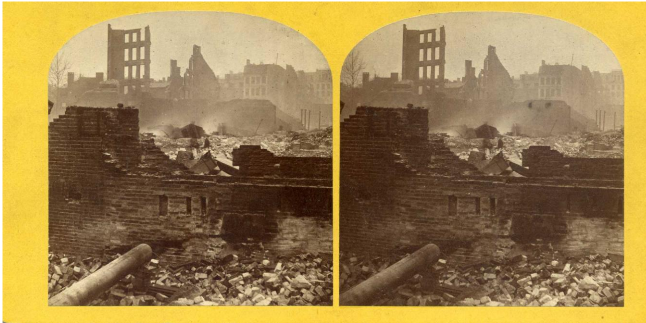
In front of 100 Summer Street, looking toward Chauncy Street.