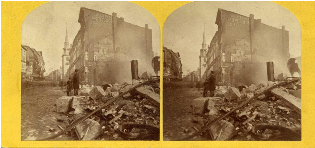
Washington Street, from near Franklin Street.