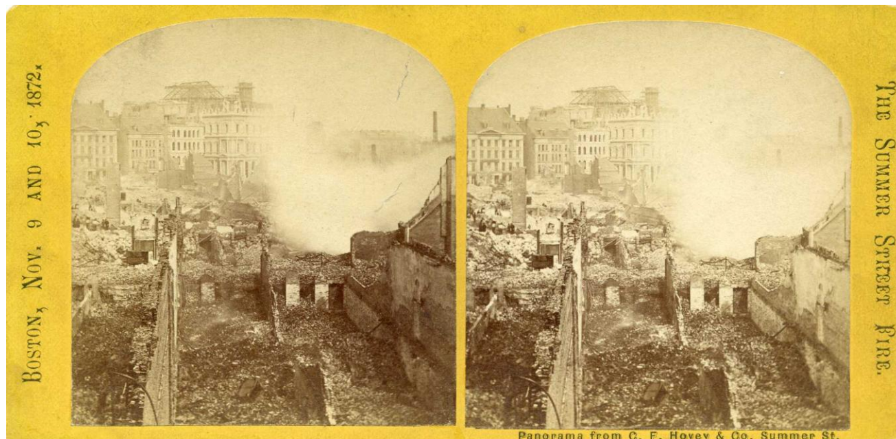
Panorama from C. F. Hovey & Co. Summer St.