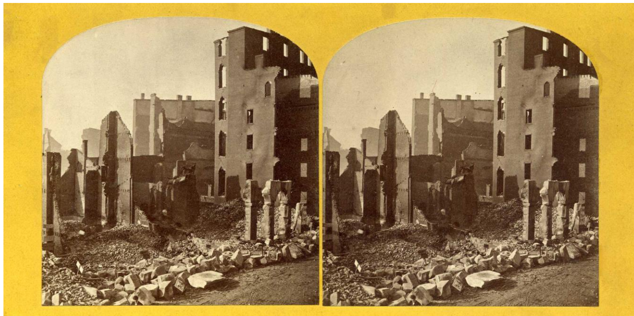
The Old South Block, Milk Street.