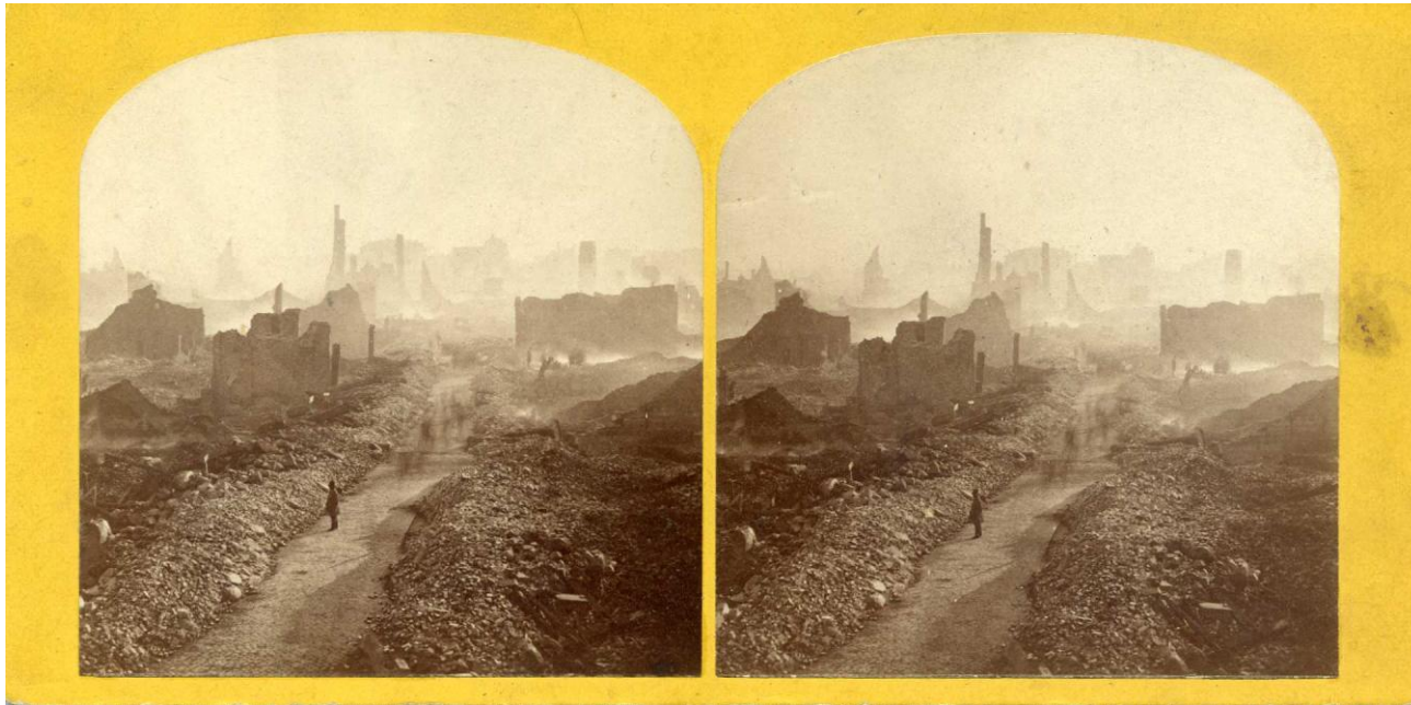
Devonshire Street, from near Milk Street.