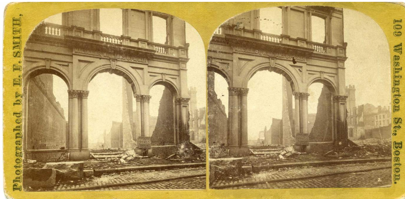
Ruins of the Macullar, Williams & Parker building at 194 Washington Street, between Franklin & Summer Streets.