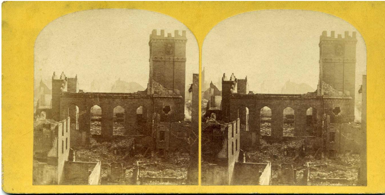
Ruins of the Trinity Church, Summer Street, corner of Hawley Street.