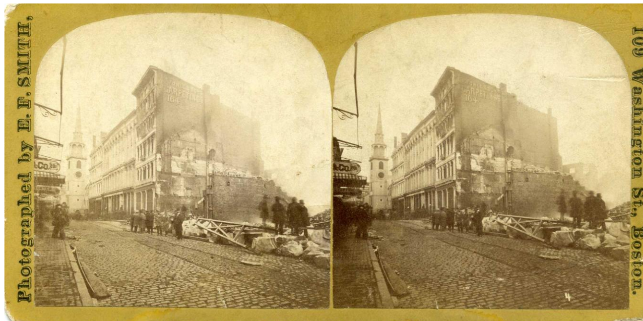
Washington Street, looking north.