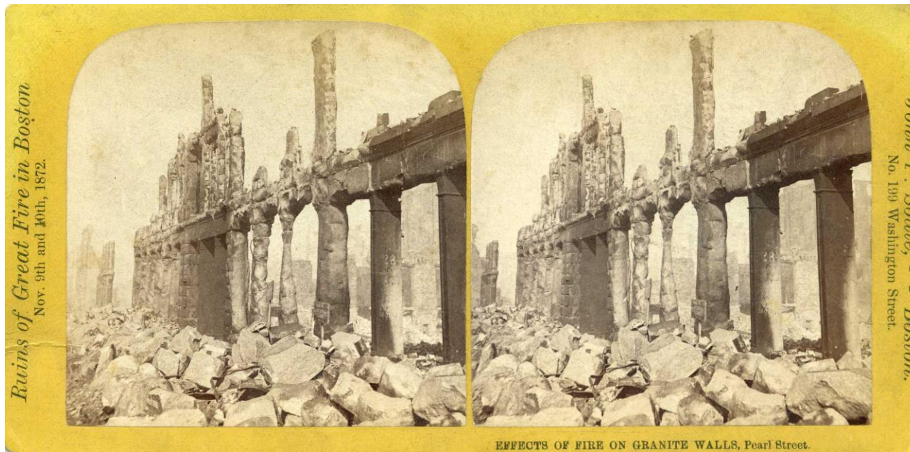
Granite walls in ruins on Pearl Street.