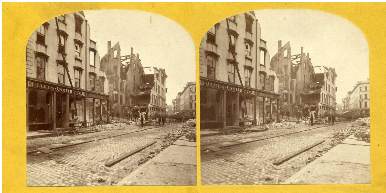
Summer Street looking toward Washington Street.