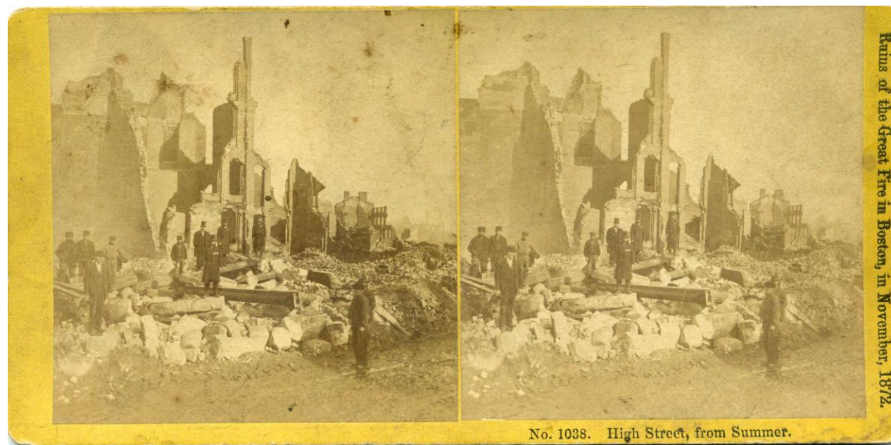
High Street, looking from Summer Street.