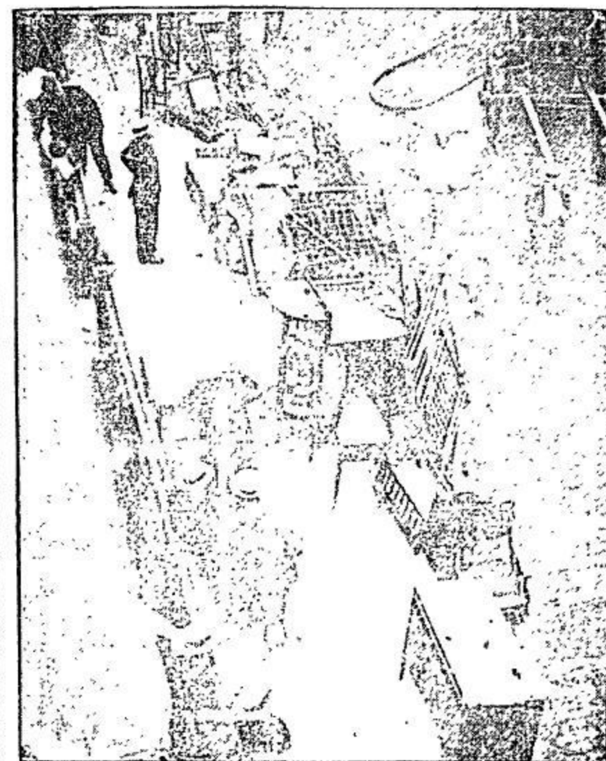
HOUSEHOLD EFFECTS SAVED FROM FLAMES PILED ON THE SIDEWALK.