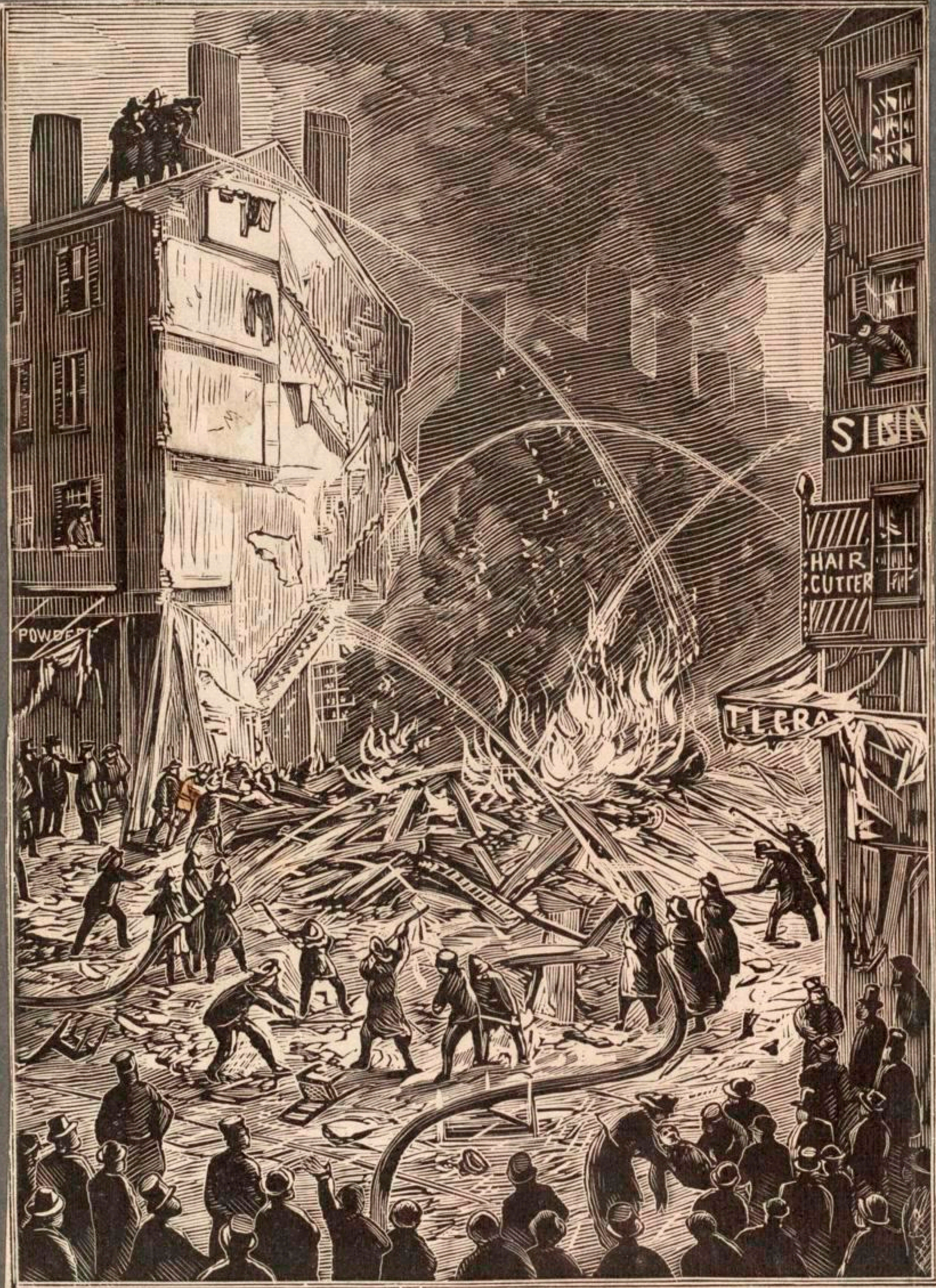
Scene after the terrible Explosion, cor. of Washington and Lagrange Streets, on May 26, 1875.