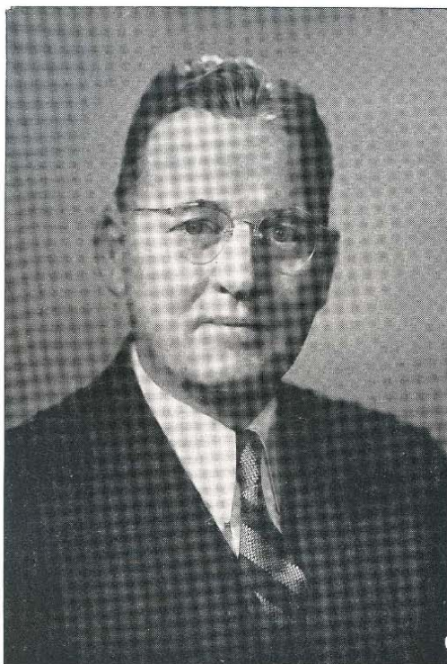
JOHN B. HYNES Mayor of Boston