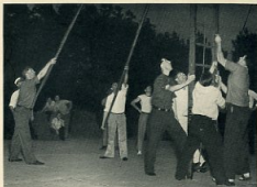
LADDER RAISING—AUXILIARY FORCE IN TRAINING