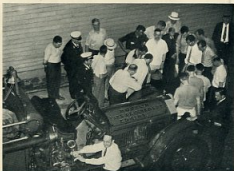
CONNECTING HYDRANTS—AUXILIARY FORCE IN TRAINING