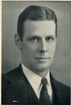
HON. MAURICE J. TOBIN Mayor of Boston