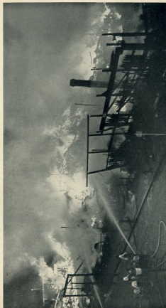
CHARLESTOWN FIRE, SEPTEMBER 19, 1941