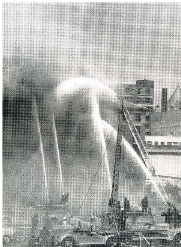
FOUR ALARM FIRE, JUNE 10, 1952. BOX 1294 (Photo above shows Tower and Apparatus Deck guns in action)