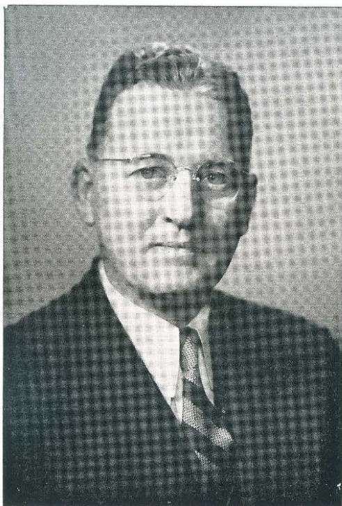
JOHN B. HYNES Mayor of Boston