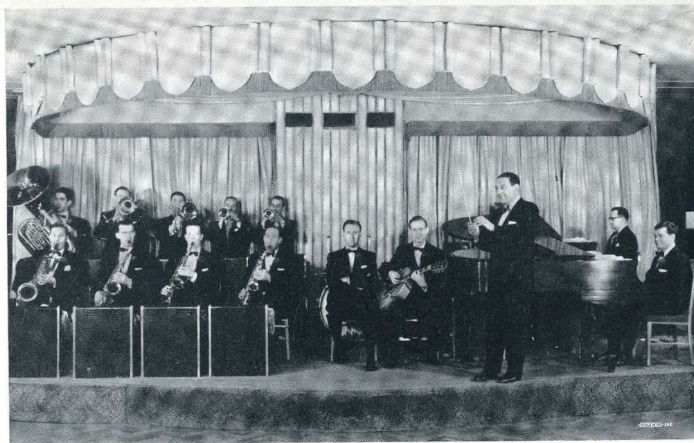
GUY LOMBARDO AND HIS ORCHESTRA — "SWEETEST MUSIC" THIS SIDE OF HEAVEN