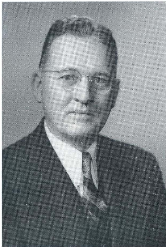
JOHN B. HYNES Mayor of Boston